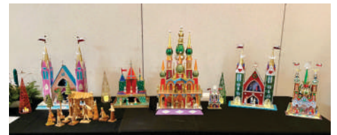
A szopki display compliments of FPA members Wigilia 2023