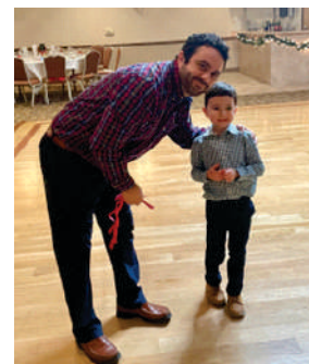
A lucky winner of one of the monetary prizes!