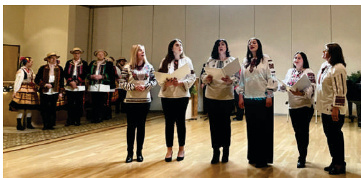
Ukrainian Women Choral Group performing at the Wigilia