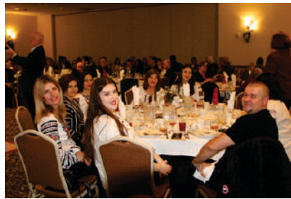
The Ukrainian Women Choral Group with their guests Wigilia 2023