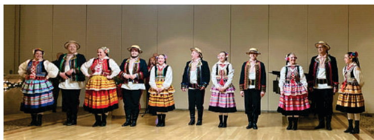
The Wawel Folk Ensemble