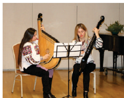
Ukrainian bandura players