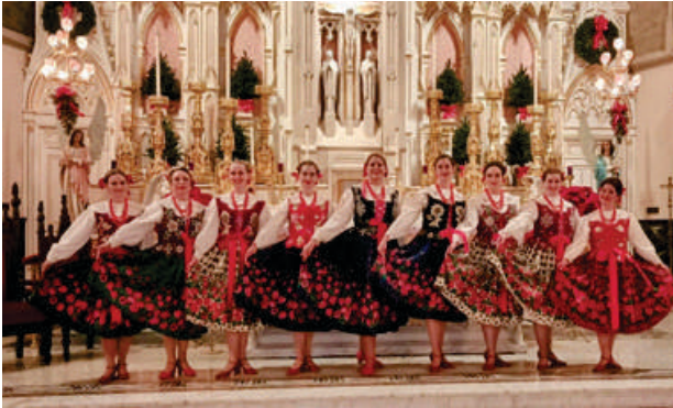
The Lira Ensemble in Koledy: A Polish Music Christmas Concert at the Sweetest Heart of Mary Church in Detroit. FPA was an active sponsor of this concert.

2615 Twelve Mile Road, Suite 118 Berkley, MI 48072-1627