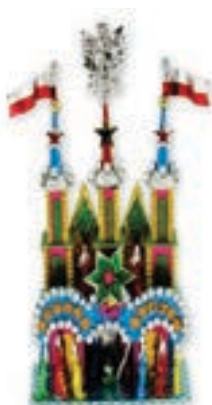
Adult, Youth & Children Prize categories