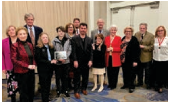
FPA members at the ceremony