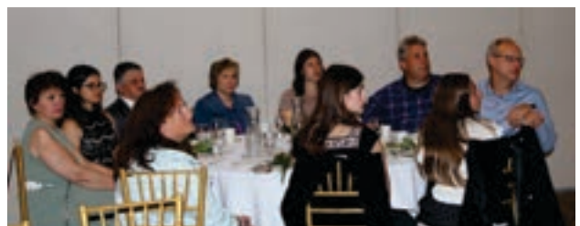
Scholarships recipients with their families