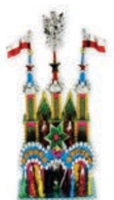
Fun project for all

Submission and presentation is at the Polish Art Center, 9539 Jos. Campau, Hamtramck, MI.