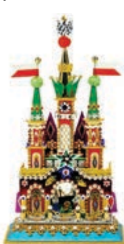
All entries displayed at the Polish Art Center