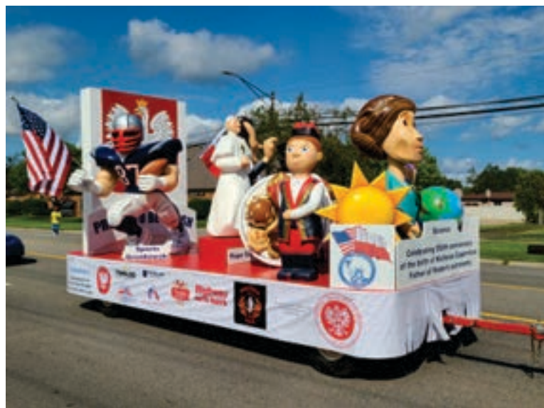
This brand-new float representing Polish Americans was sponsored by PAC Michigan Division