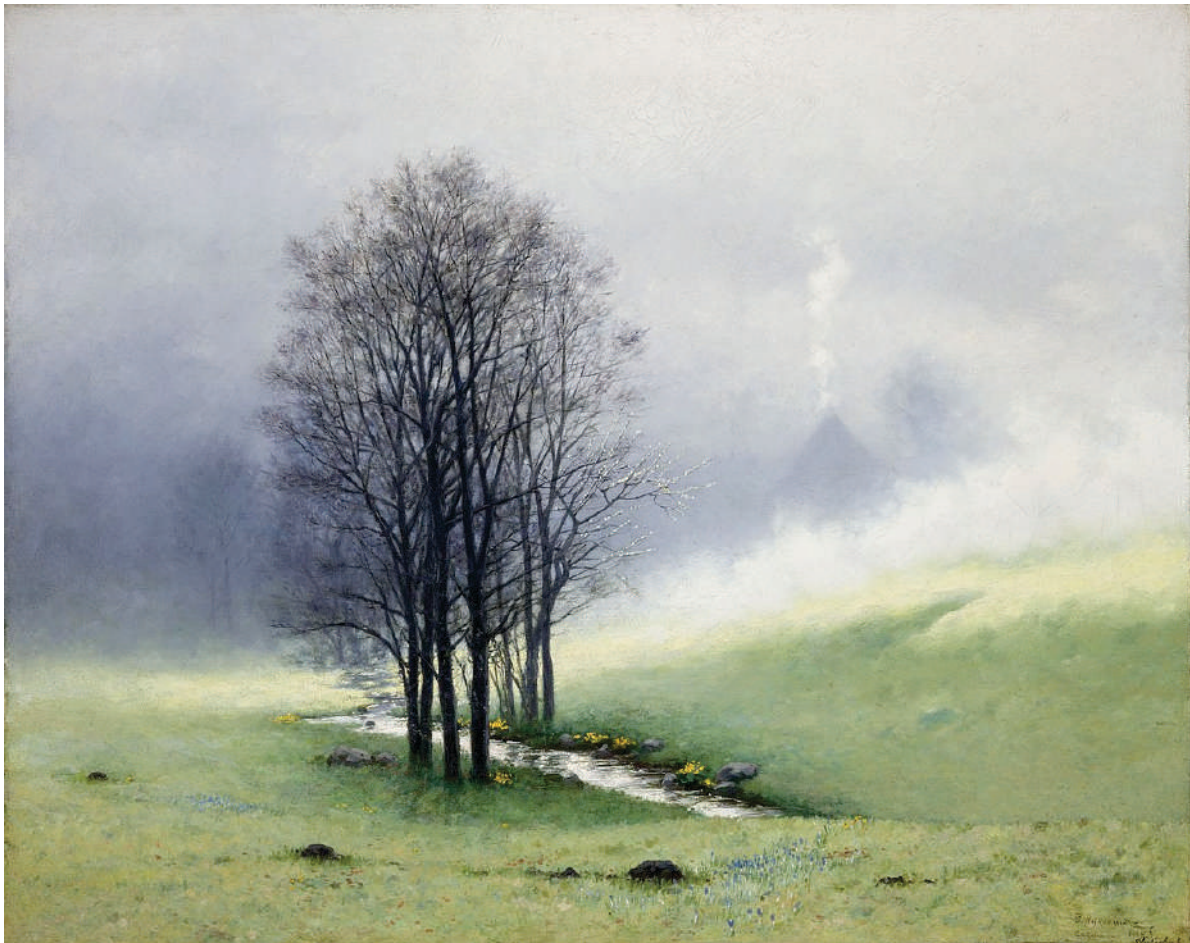
Springtime Fog (Mgla wiosenna) By Stanislaw Witkiewicz, 1893 in National Museum, Krakow

By now you should have received a copy of the Newsletter from the American Council for Polish Culture of which FPA is an affiliate. This year ACPC's annual convention will take place in San Antonio, Texas July 27 – 31, 2022 . It looks like a very exciting event. Any member, and friends and family, of FPA can attend the convention. All of the details can be found at their website: www.polishcultureacpc.org .